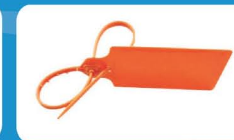
BIG FLAP CROC